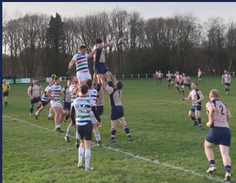
Royals v A-As at Wigan 2018