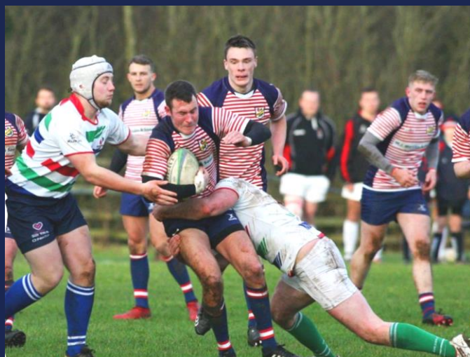
Royals v A-As at Preston 2016